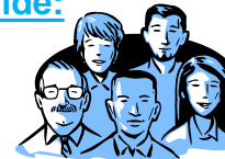
Taxi, Bus and School Bus Drivers