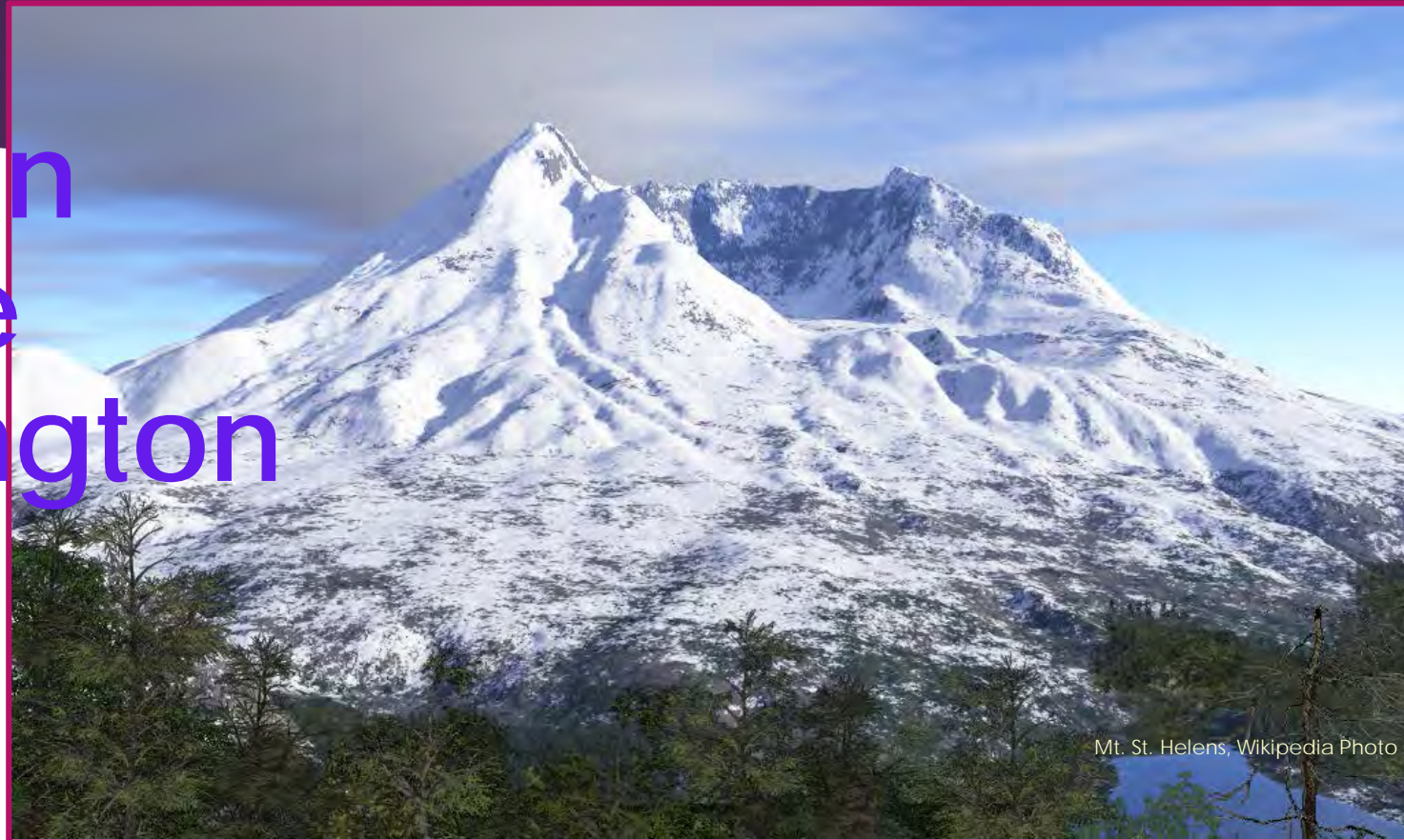
Mt. St. Helens

ARCH National Respite Conference, " Elevating Respite ", 9/20-22/16, Denver